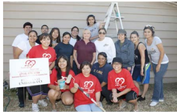
Hermanas Unidas de UCI Paint Your Heart Out, 2013

The event will take place over two days in the Spring 2014 quarter, and entails the cleaning of the exterior of homes the first day and then the painting of homes on the second day. Please join this UCI student group for this fabulously productive event, as well as their meetings. Hermanas Unidas meets every Wednesday at 7pm in Humanities Hall 262.