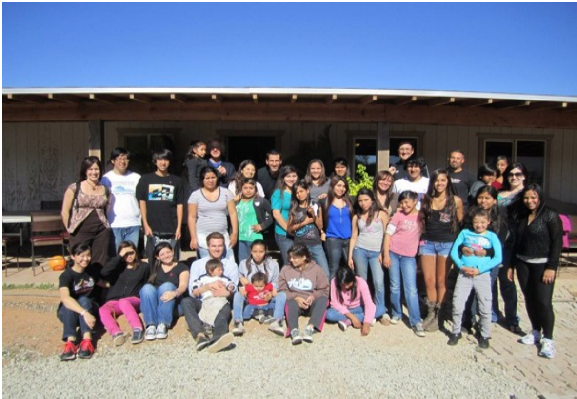
The Community Knowledge Project Team 2013

Moreover, the Community Knowledge Project prepared me with the skills and confidence I needed when I conducted fieldwork in Mexico. I became comfortable to conduct ethical research across international borders. The analysis of my field notes and experience became almost second nature to me. Without the Community Knowledge Project, I would still consider myself a student rather than a researcher.