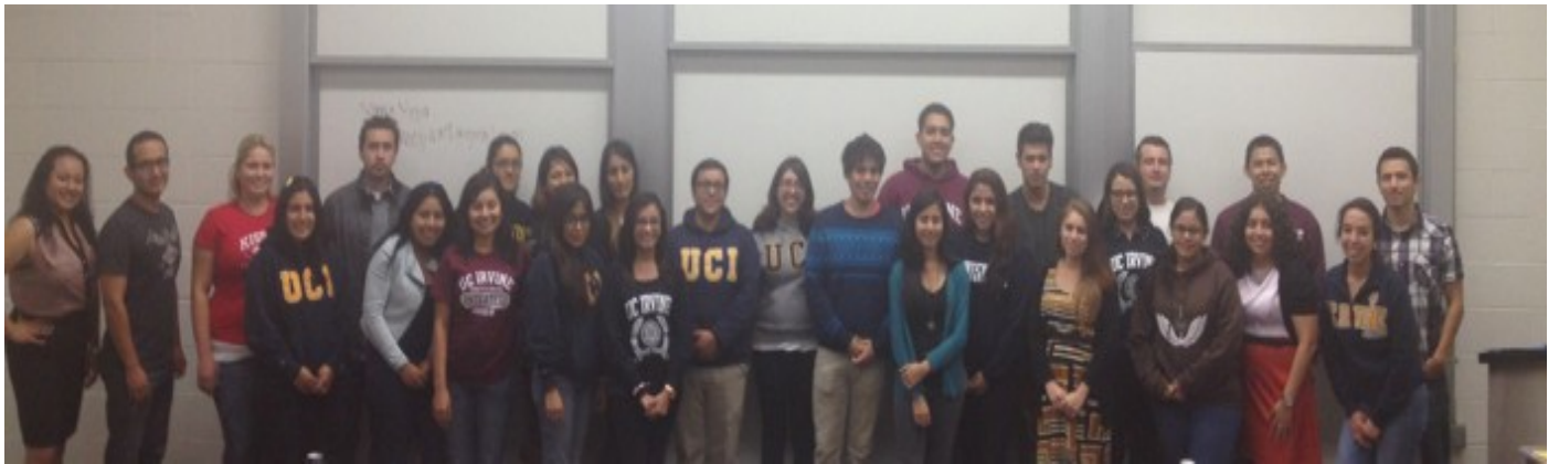
Bottom: FUTUROS Workshop