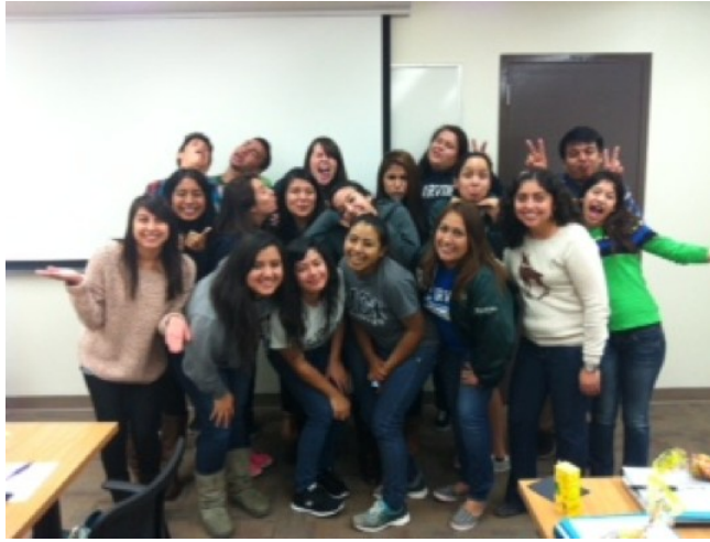
Top: UCI SOY WORKSHOP