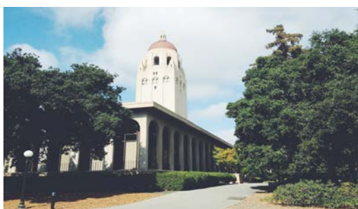
Stanford University, 2013

The reason I share these intimately energizing moments is not to reproduce the exhausted trope of “overcoming adversity.” If we are “keeping it real,” I have not actually “made it.”