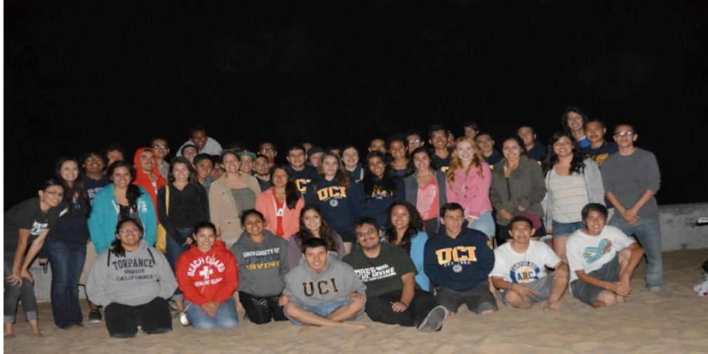
MAES Mixer, 2013

MAES – Latinos in Science and Engineering is a Latina/o based organization at UCI that focuses on the advancement of Latina/o students in the fields of STEM (Science, Technology, Engineering, and Math). This student organization primarily focuses on academic advancement, professionalism, community outreach, and the concept of familia . MAES has become more than just an organization. It serves as a home away from home for our members. We provide students with the support they need to succeed in their educational and professional careers, and to promote STEM in their local communities. Every year we host a Science Extravaganza, in which we bring together 250 middle school students from throughout southern California and their parents to learn about STEM at UCI. If you would like to join MAES, and be a part of wonderful collaborations, please contact us at: maes@uci.edu .