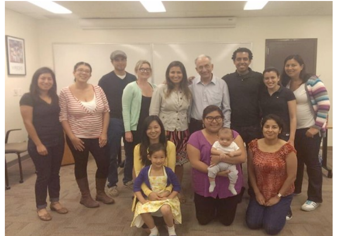
Chicana/o-Latina/o Graduate Student Collective, 2013

We welcome everyone to like our Facebook page or to check our website at http://clubs.uci.edu/clgsc/ in order to stay up to date with the club's activities and meetings. Officers of the club welcome any inquiries about the collective and we welcome ideas for future workshops and events. We will hold meetings every other Friday during the Winter quarter.