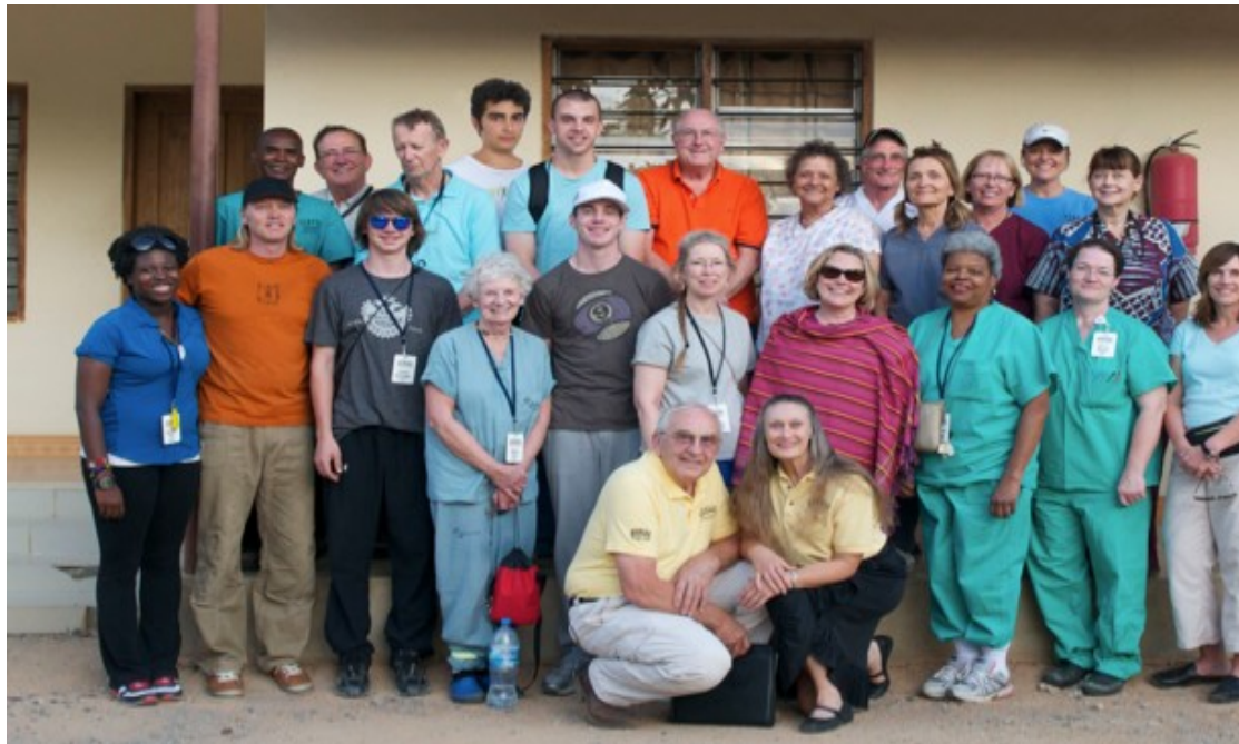
Uganda 2013 – Charles Drew/UCLA Medical Mission Group