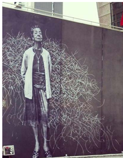
Jose Parla, “ The Wrinkles of the City ” (2012)

Parla’s art has been shown in Canada, Hong Kong, London, Paris, Thailand, Tokyo, and throughout a maze of New York neighborhoods. His exhibition, “ The Wrinkles of the City ” (2012) involved creating murals of everyday Cuban life and emotions on neighborhood buildings in La Havana, Cuba. Already prolific, Parla continues to expand on his work, at times working on twenty paintings simultaneously.