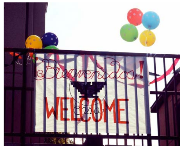
UCI CASA Cesar Chavez Welcome Day, 2013

Casa Cesar Chávez is a unique UCI residence that offers a sense of familia, comunidad y respeto . Throughout the year Casa Cesar Chávez residents organize and implement various events to establish lasting bonds with each other and the surrounding UCI community. Often the first in our families to pursue a college degree, Casa Cesar Chávez residents work together to host Haunted Vista, Día de los Muertos , and an annual Carne Asada Luncheon in honor of UCI’s maintenance and grounds staff. Residents also welcome UCI organizations and clubs to simply visit Casa Cesar Chávez, as we have found it most promising to invite fellow students to learn about our day-to-day life in the Casa. Students create a home away from home, one that honors the beauty of being Chicana/os/Latina/os at UCI.