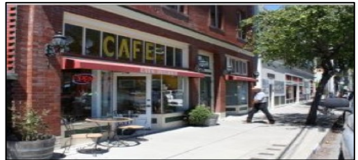
Current [Engaging, educating, and providing opportunities for civic engagement in land – use decisions]