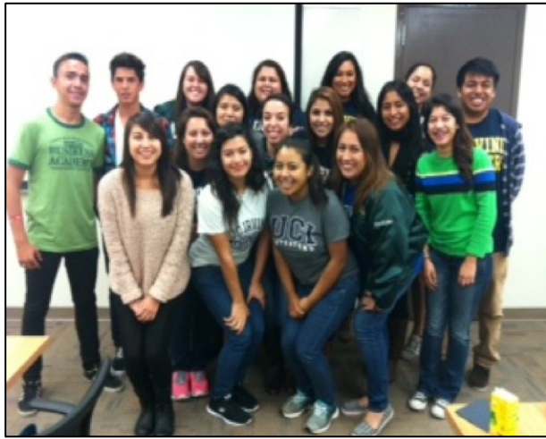
Phi Lambda Rho Sorority Mentoring Workshop, 2013

Four years later, the same objectives were well worn and I set new ones for myself. Like glossy photo paper, these goals had a bright luster—compelling me to engage in broader, countywide discussions working as the project manager for a nonprofit organization connecting people to health and human services throughout the county. Bright flash. Two years from now I will open a broad door upon receipt of my masters degree in urban planning, striving to re-map the traditional planning discourse and creating healthier spaces. 28 today. 18 yesterday. Acknowledged. Re-focus. Moving forward.