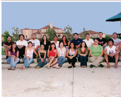
Casa Residents 2005-06

This past May, Casa César Chávez received the most awards for a single academic theme house at the Annual Arroyo Vista Theme House Awards Ceremony. Casa was recognized for its